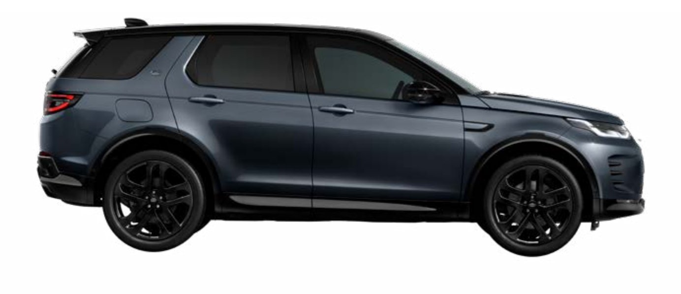
Overall length 4,597mm