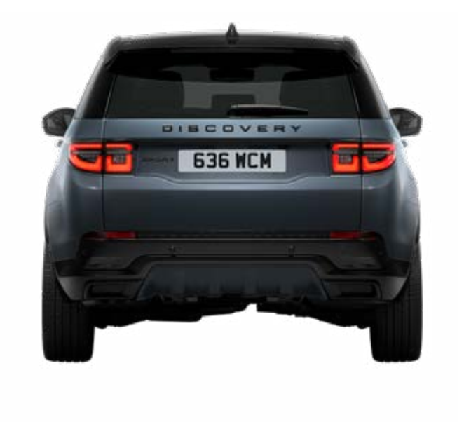
Rear wheel track 1,631.3mm

Weights and dimensions shown apply to standard-specification, unladen vehicles, which may be affected by optional features and equipment.